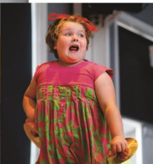
KNS Talent Quest (Thanks Poppy and all the other helpers)