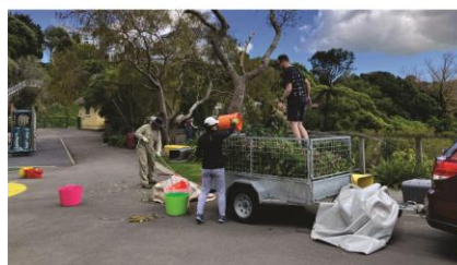
Garden Working Bees