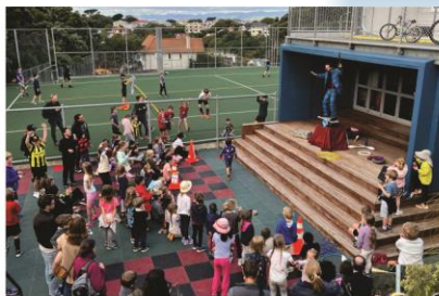
Annual whānau school picnic