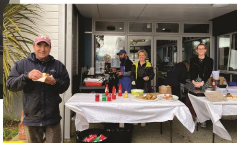
Democracy sausage sizzle and bake sale