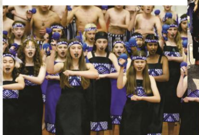
$1,250 towards head bands for Kapa Haka