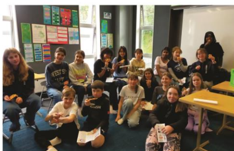
Librarian end-of-year lunch